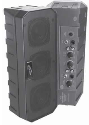
PI30 16-Channel UHF Powered Speaker